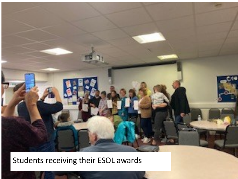
Students receiving their ESOL awards