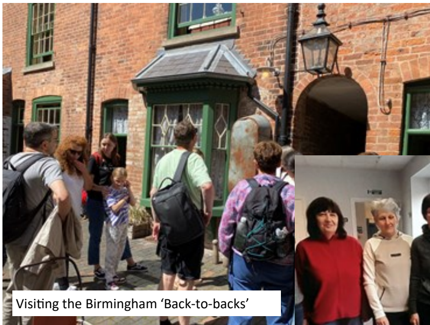
Visiting the Birmingham 'Back-to-backs'