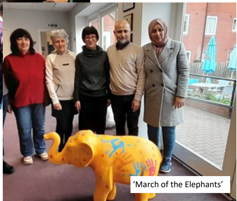
'March of the Elephants'